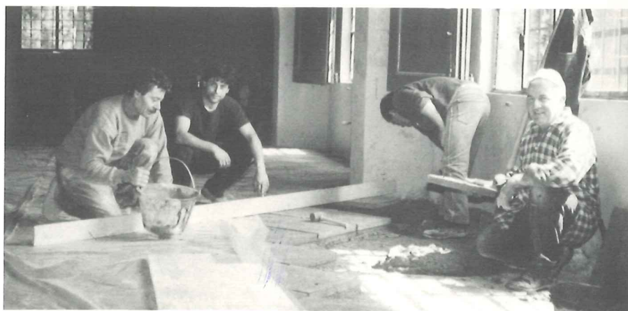
Workmen ready the limonaia for its dedication on September 28, 1990.