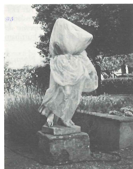
Lady-in-waiting: veiled in protective plastic, a garden sculpture awaits completion of work on the limonaia.