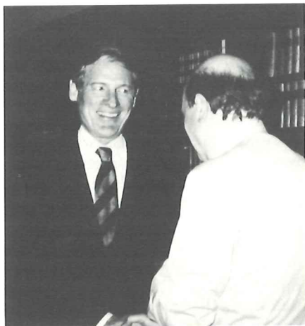
Harvard Visiting Professor Harvey Mansfield receives well-wishers following his talk on Machiavelli in the Biblioteca Berenson.