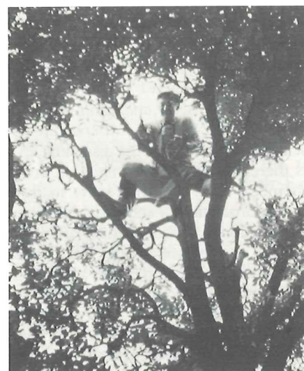
Gigi Brandi tackles a tree in the ilex grove at pruning time.

Built originally to house lemon trees during the winter months, the limonaia