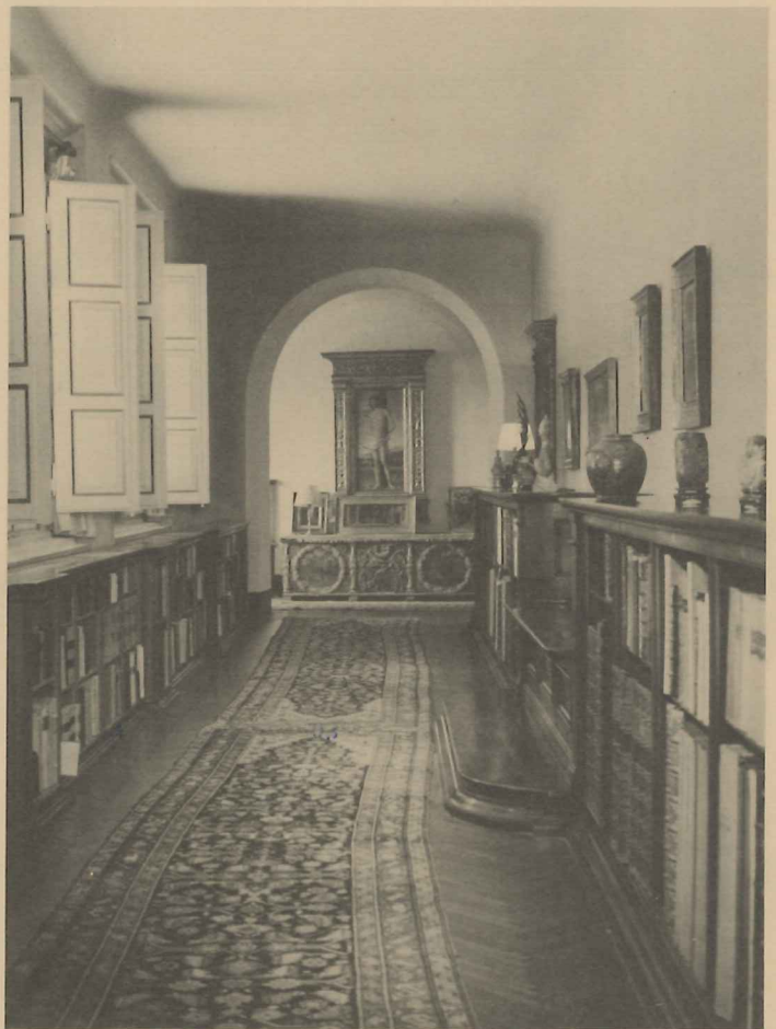
Corridor, Villa I Tatti

The Biblioteca Berenson is deeply grateful to the families of the donors of these collections, which represent lifetimes of scholarship and selective acquisition. One of I Tatti's primary goals is the well-considered expansion of the Library, so that it may be of continuing value to the Fellows and other scholars. As acquisition monies are reduced and the price of books and subscriptions rises, bequests are of enormous help in meeting the Center's commitment to the Library.